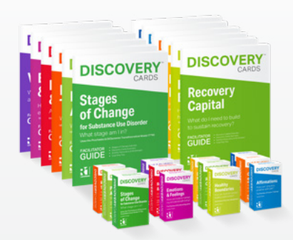
For Clinicians, Coaches, & Peers