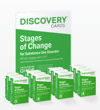
Group Kits for Each Topic